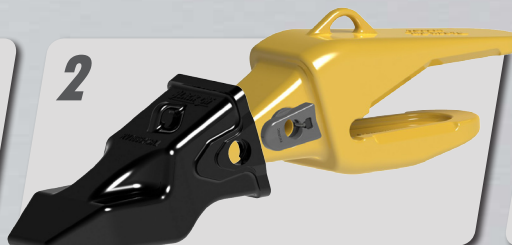
2 Fit Tooth over Nose & Converter