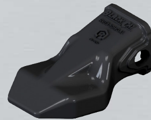
Heavy Duty Abrasion