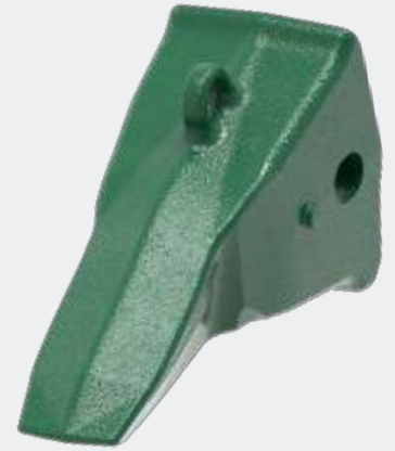
MaxDRP™ Plus ripper point