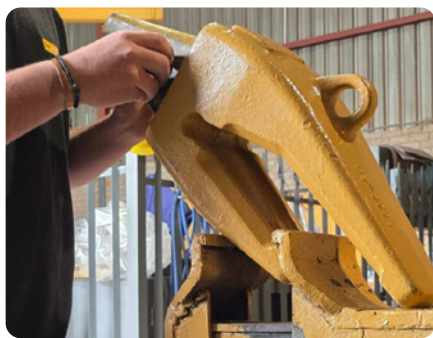
Adapter secured in vice for demo purposes.

The CapiParts J600 Hammerless System streamlines GET maintenance by replacing high-impact pin driving with a safer, faster mechanical lock. This innovative design eliminates the need for hammers, drastically reducing changeout times and improving job site safety without sacrificing durability.