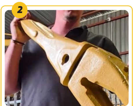
Slide the tip onto the adapter until fully seated.